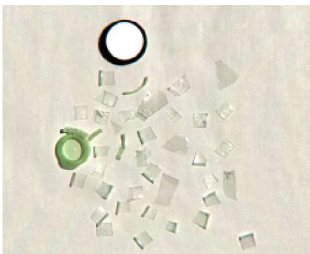
Figure 3 : the plastics are indistinguishable in the visible region

The indices were effective in clustering the different types of plastic. Following this, a machine learning algorithm was trained which was then used to classify a mixed sample of plastic pieces. The sample set is shown in Figure 3 .