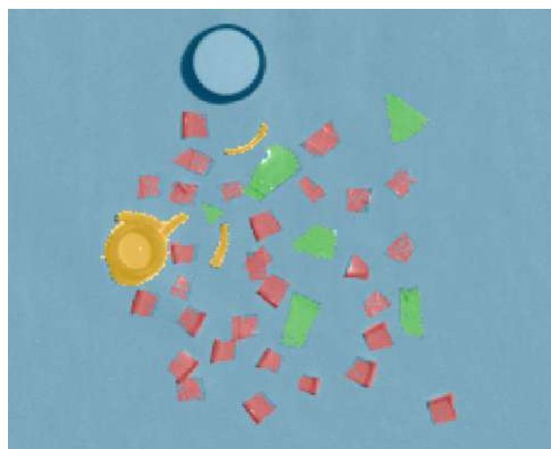
Figure 4 : Using HERA, the different plastics are easily categorised

Figure 4 shows the results of the classifying algorithm, which is effective in sorting the three types of plastic in the field of view.